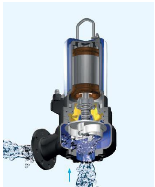
With the optimized Vortex flow path, clogging is prevented and wear is minimized.

Innovative impeller design is provided in cast iron as standard. Hardened iron or rubber coated options also available.